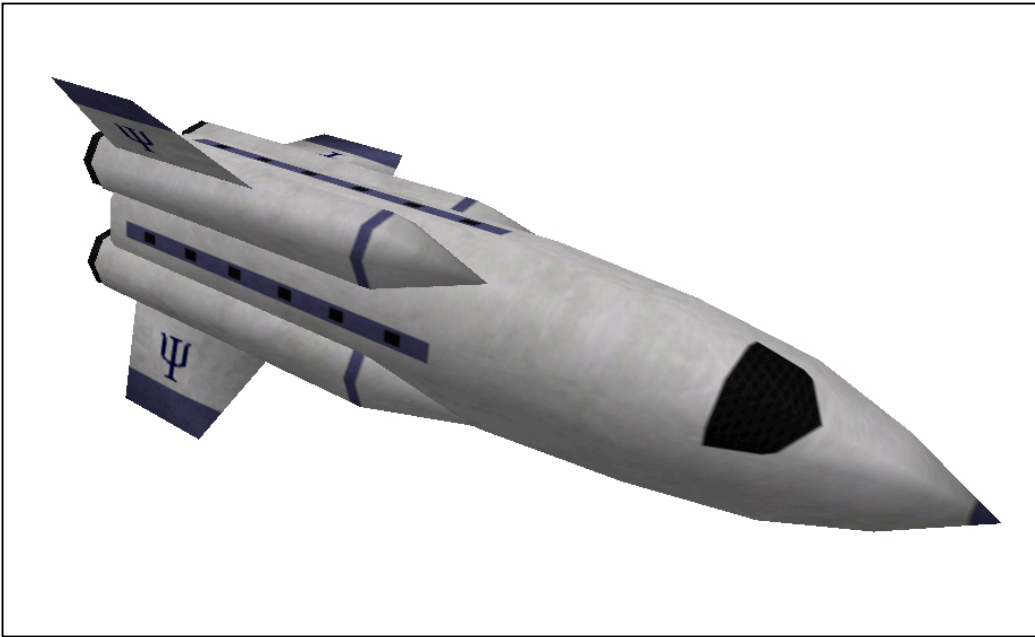
End of the dream? A Trident H-4 shuttle of the type operated by Flight 272